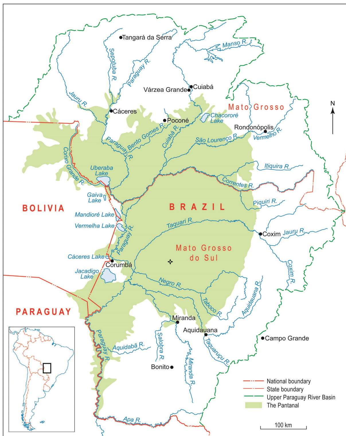
Fig. 1. Location and extent of the Pantanal wetland in South America. The star in the Nhecolândia region depicts the Nhumirim Farm (see Section 2.2 for further discussion); Outline of the Pantanal based on Assine et al. (2015).

(Calheiros et al., 2012; Coelho da Silva et al., 2019). Different authors differ with regards to their assessment in how far these impacts can be mitigated through careful reservoir management, also considering the variation in size among dams (Bergier, 2013; Fantin-Cruz et al., 2015; Zeilhofer and de Moura, 2009), and further research is thus warranted (Coelho da Silva et al., 2019; Silio-Calzada et al., 2017). Another example are the high levels of mercury in rivers polluted by gold mining activities, which then accumulate in fish and other animals of the local food