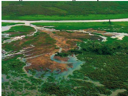
Figure 3 – “Breaching” in Taquari River