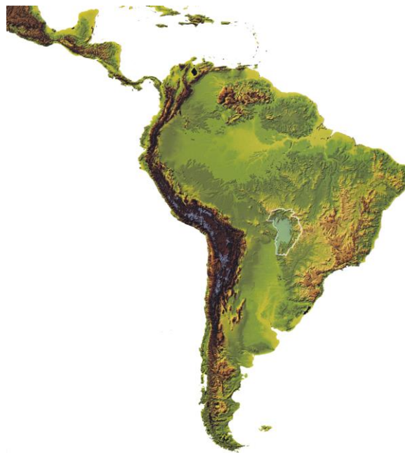
Figure 1 – The Pantanal Region

56. Surrounded by the Planalto , the Pantanal has been identified as a wetland of global significance by The Nature Conservancy and World Wildlife Fund. Major tributaries to the Upper Paraguay River are the Apa, Aquidauana, Cuiabá, Miranda, Negro, São Lourenço, and Taquari rivers, all of which discharge to the Pantanal.